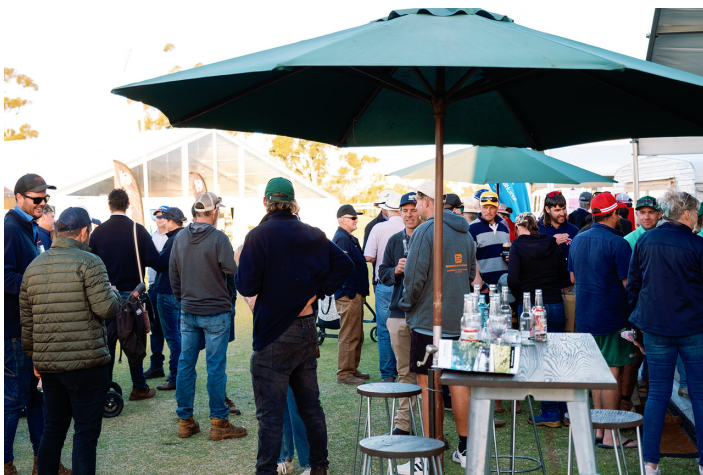
Exhibitor sundowner Mingenew Midwest Expo 2023.

Exhibitors are not permitted to run generators from their exhibit site at any time or on the camping grounds after 8pm.