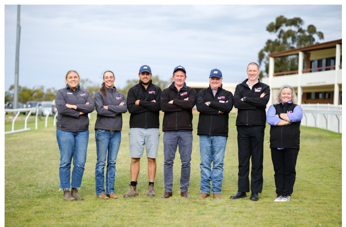
Mingenew Midwest Expo board of management 2023