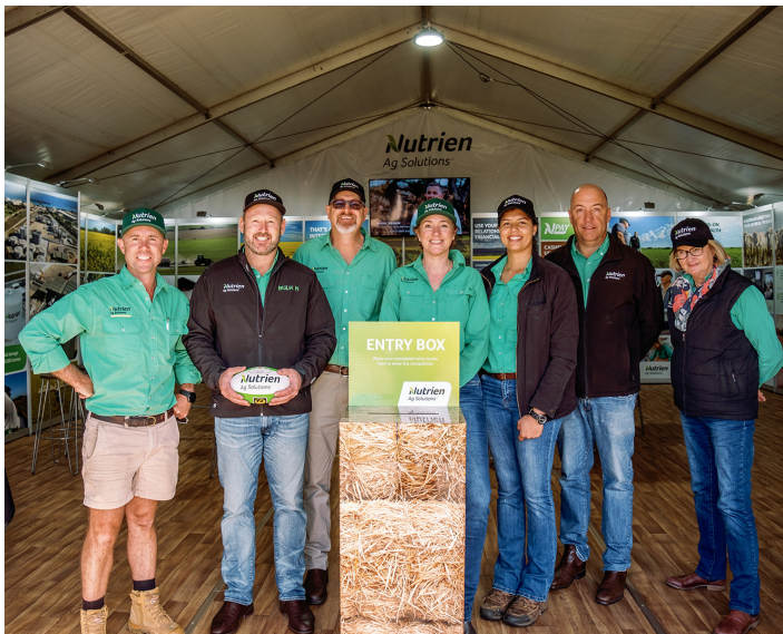
Nutrien Ag Solutions Mingenew Midwest Expo 2023.

No second hand or bric a brac items permitted.